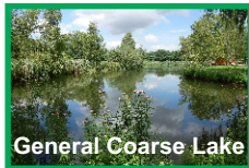
General Coarse Lake