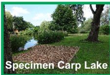
Specimen Carp Lake