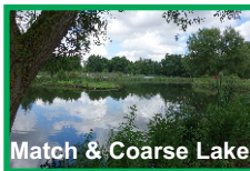
Match & Coarse Lake