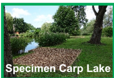
Specimen Carp Lake