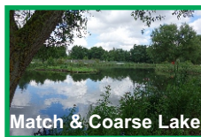
Match & Coarse Lake