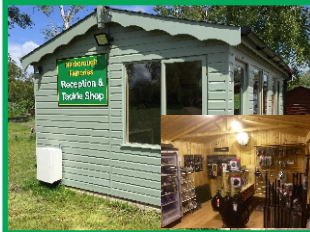
Reception / Shop